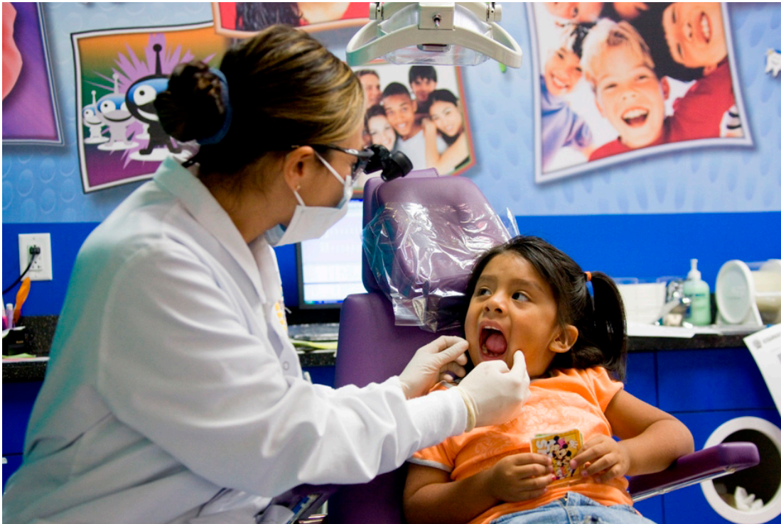
The East San Jose Children's Dental Center established an innovative approach to providing pediatric dentistry, and is designed to improve access to high-quality dental care for underserved children. The Center is unusually large in its size, occupying a 6,000-square-foot facility that contains 14 dental chairs. The Children's Dental Center also has a unique physical design and décor that is welcoming to children. The Center employs a full-time bilingual outreach coordinator to ensure access to children from bilingual and multilingual families. The Sunnyvale clinic, while smaller than the East San Jose Center, shares a similar, child-friendly design.