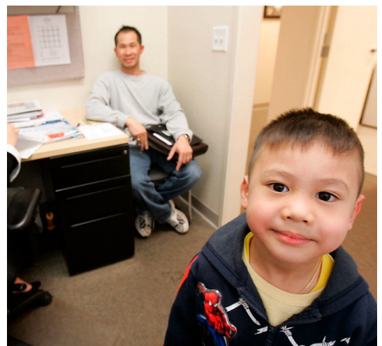
Every year The Health Trust enrolls thousands of children in health insurance.

A recent study, conducted by Mathematica and funded by the David and Lucille Packard Foundation, demonstrated that enrollment of children in health insurance contributes significantly to children having a regular source of dental care, receiving preventive dental visits, and receiving dental treatment, while dramatically reducing unmet need for dental care. 10