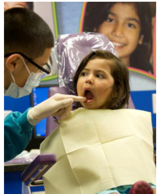
Above, a young girl makes a routine visit to her dentist and has her teeth examined.

Low-income children and minority populations are the most likely to suffer from poor oral health.