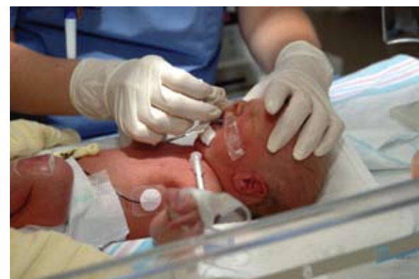
Only Lucile Salter Packard Children’s Hospital at Stanford and Santa Clara Valley Medical Center have received the State’s highest designation as Regional Neonatal Intensive Care Units.

A recent study by Pacific Health Consulting Group 34 on specialty care access found significant issues in Santa Clara County. The study surveyed safety net providers in Santa Clara County and found that providers have a difficult time arranging referral appointments for their patients, particularly for gastroenterology, orthopedics, ophthalmology, and neurology services in the Santa Clara County safety net.