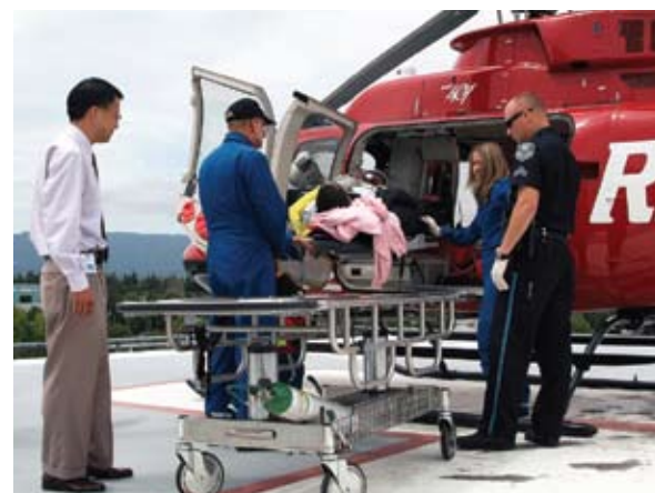
More than five hours every day of the year, at least one hospital in Santa Clara County is diverting ambulances away from its emergency room because it is at full capacity.

In order to comply with the state seismic standards, Santa Clara Valley Medical Center needs to rebuild areas of the hospital that contain 52 percent of its beds - 272 beds in total. Although the state has mandated seismic safety improvements, it does not provide any funding for construction or seismic upgrades. If the seismic requirements are not met, Santa Clara Valley Medical Center will be forced to close 272 beds. This will result in more than 11,000 admissions having to go to other hospitals, which is about 47,000 patient days annually (130 patients per day) having to be accommodated by other hospitals.