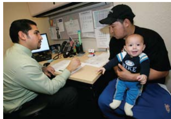
The Health Trust's Wellness Access and Education program helps families enroll in insurance programs including Medi-Cal and Healthy Families. Assistance is provided in English, Spanish and Vietnamese.

In 2005, 61.6 percent of Santa Clara County residents aged 18 and over had private health insurance coverage through employers, and another six percent had individually-purchased private coverage. 7 Low-income residents in Santa Clara County are covered by a variety of health insurance programs (the type of program varies based on age and income level). These programs